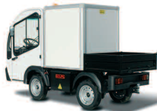
Combined deck / box van