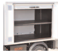
Mid height shelf