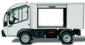
2nd lateral shutter