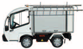
Side ladder carrier