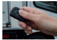
Remote central locking