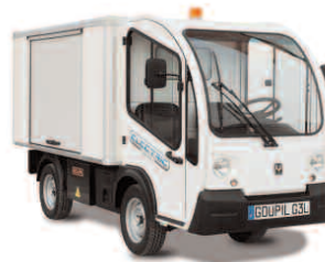
Wide box van 1,25m cargo area width